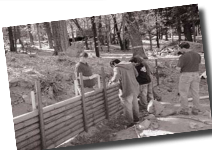
Laying the poles