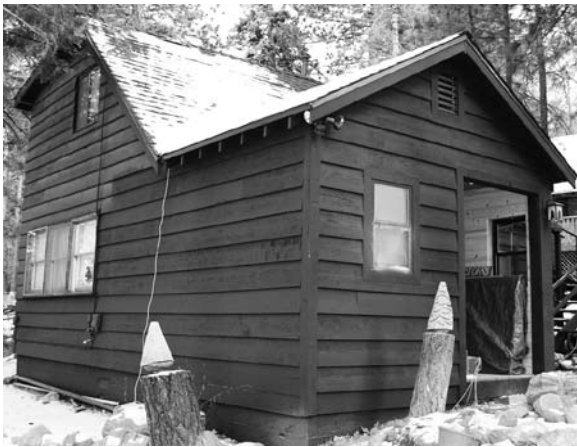
New roof & entry "in progress"

Another improvement currently being worked on is an upgrade of the front entry.