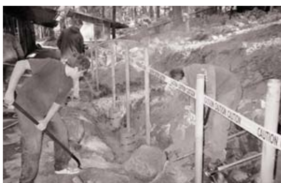
Setting the posts in concrete