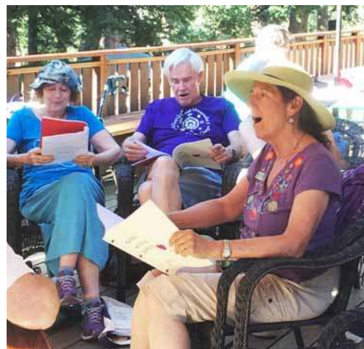
Fellow Summer Break participants

late afternoon singing and wine, games and talks with like-minded people, yoga every morning, daily workshops, and a magnificent choir concert in Sanctuary space—this