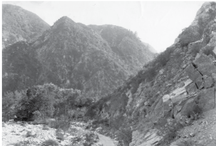
Old Mill Creek Road

his brothers in the San Bernardino Society of California Pioneers remembered his great love for his mountain home and imagined that he might have exclaimed, “Here stands magnitude, giving the instant impression of a power above man: grandeur that belies decay; antiquity that tells of ages unnumbered; beauty that the age old tune makes more beautiful; strength impervious as the globe; the monument of eternity; the truest emblem of that ever-living,