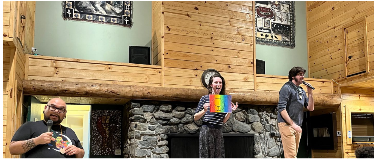
for skillfully managing not only the talent show, but also the live auction that was folded into the event and with which we raised $950 for UUSM, and also $2000 for Camp.