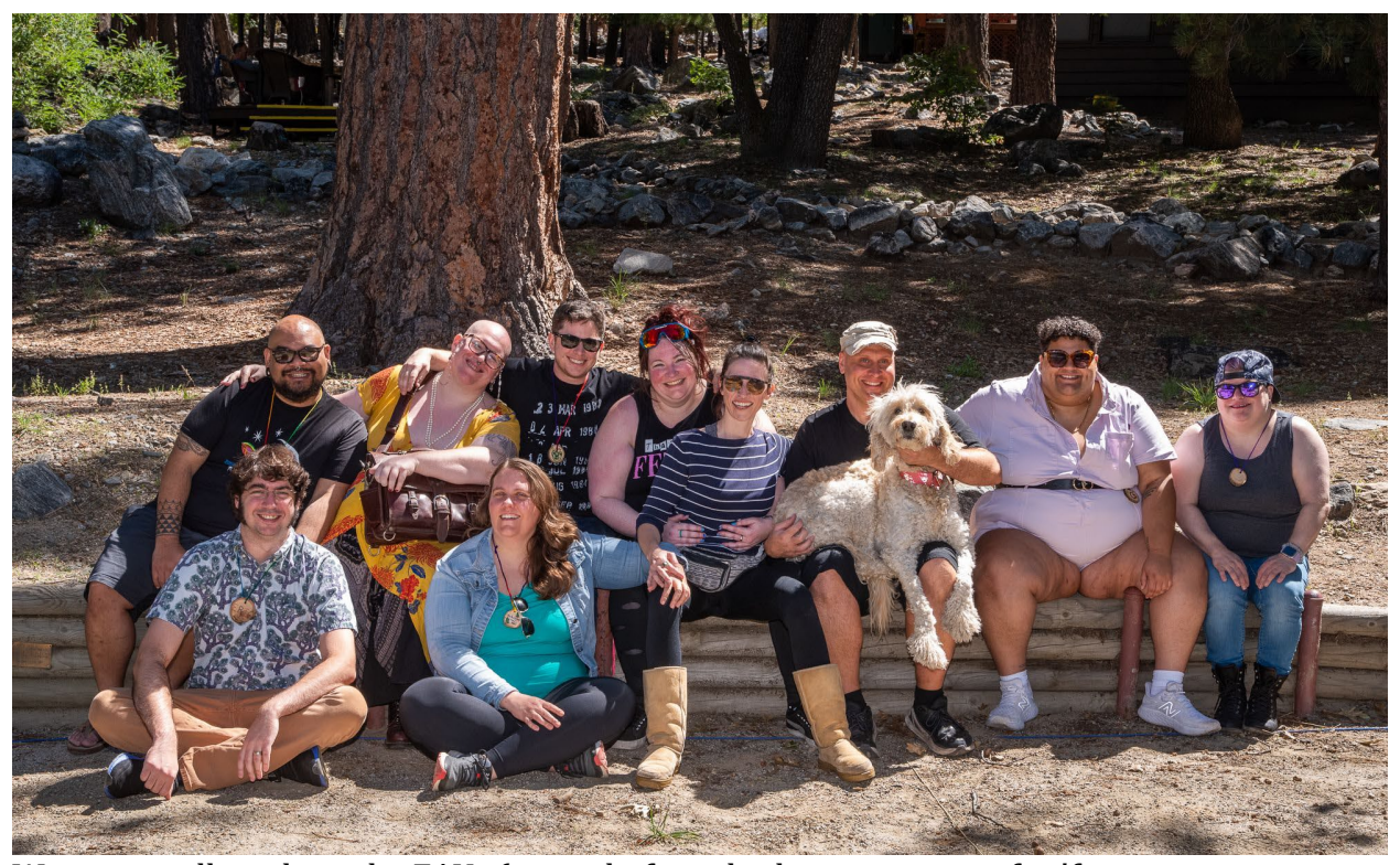
We got to calling them the FAYs (a cart-before-the-horse acronym for 'former young adults), UUs from several different churches including UUSM.

This year we were joined by folks from previous Young Adult Group de Benneville, who have aged out of YAG.