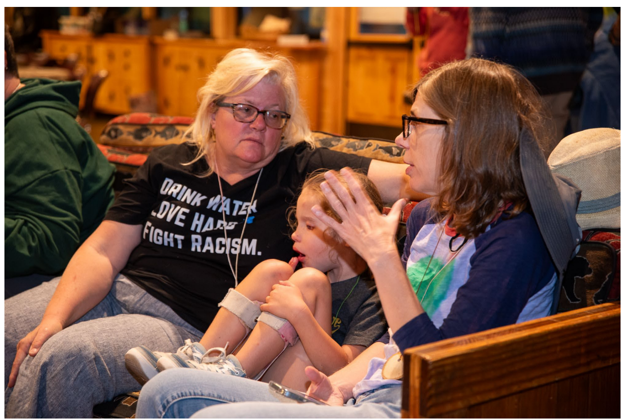
are something to behold.