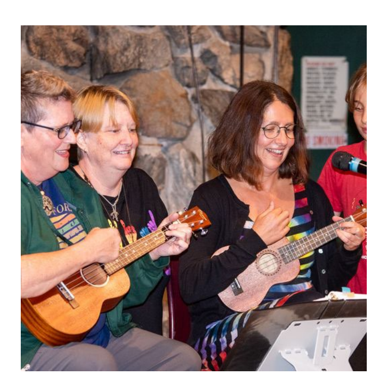
and the songs flowed. So did the water (stay hydrated!!), but so did the wine, toward the end of the day. Still, the conversations, especially intergenerational,